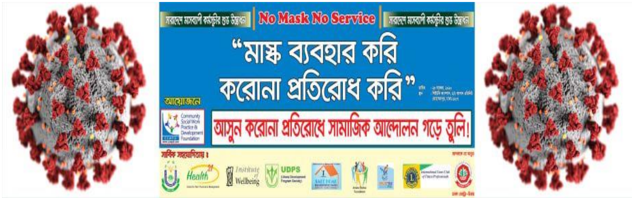
Photo Sharing of the On-going Mask Awareness Project (Events already held)